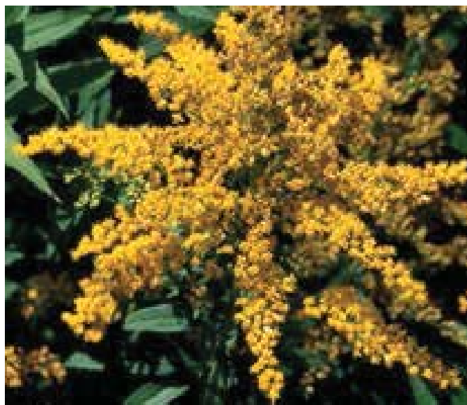
Solidago c. 'Baby Gold'