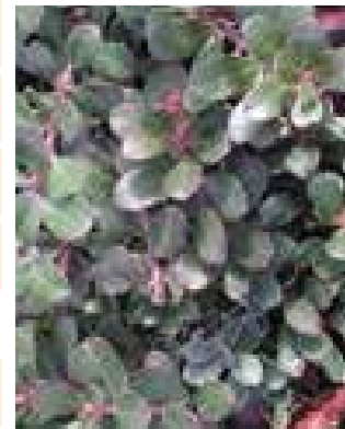
Arctostaphylos u. 'Alaska'