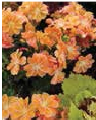
Lewisia 'Sunset Strain'