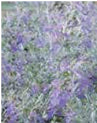
Teucrium f. 'Azurea'

Wind block, privacy, road noise reduction; all are important uses for hedges and screens. Sometimes they're purely aesthetic. Formal gardens, knot gardens, and miniature gardens can all benefit from low growing hedges. Here are the plants needed to create an informal, natural looking hedge over 20' in height, down to a manicured 6" garden barrier.