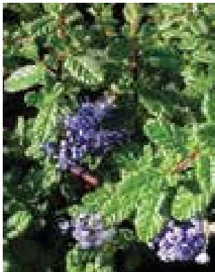
Ceanothus 'Julia Phelps'