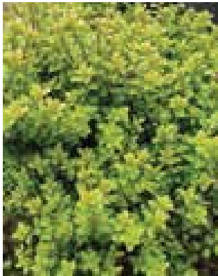
Lonicera nit. 'Twiggy'